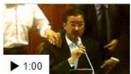
Moment bomb hits Afghan parliament 2 hours ago