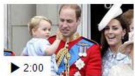
George eyes crowd at Queen's birthday 13 June 2015