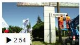
Life in Ukraine's rebel-held Donetsk 7 hours ago