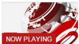
One-minute World News 2 hours ago