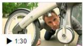
The e-bike without a chain 19 June 2015